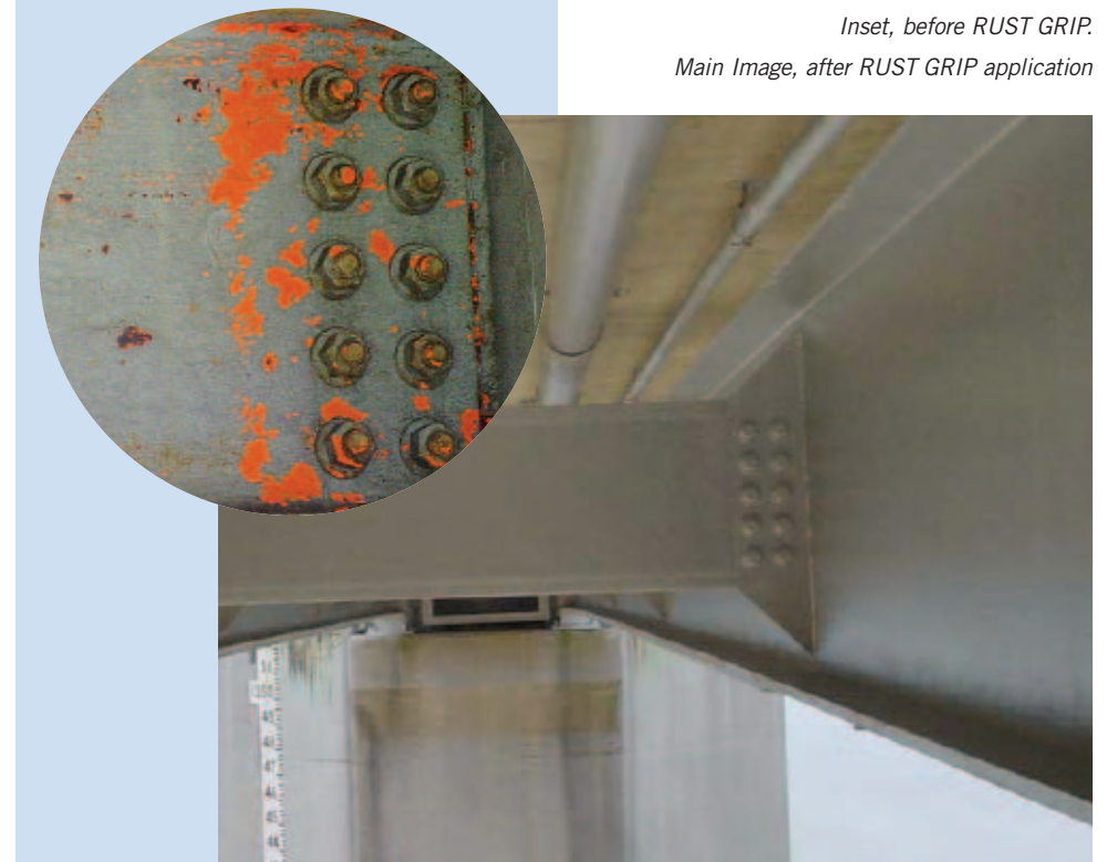
Below: Danville Bridge Project – Inset, before RUST GRIP. Main Image, after RUST GRIP application

Silver-Gray in color. It cannot be tinted due to the aluminum pigments which gives it its strength and durability. It can be top-coated in the color desired anywhere between 1 to 24 hours (according to current temperature and humidity). Surfaces must be totally dry. It cannot be used over wet or moist surfaces. Not for use in situations of constant underwater immersion. It can be used as a primer for epoxies and other coatings made for total immersion. Not recommended for use around high ammonia levels. It can be used as a primer coat for other coatings. Not for use on food preparation surfaces that are in direct contact with foodstuffs . RUST GRIP is USDA approved for use around foods, food preparation and facilities. RUST GRIP cannot be applied over pack-rust or scale. This must be removed as it tends to hold and hide moisture. Tight surface rust, up to 1/8th inch, that is totally dry can be coated with no problems.